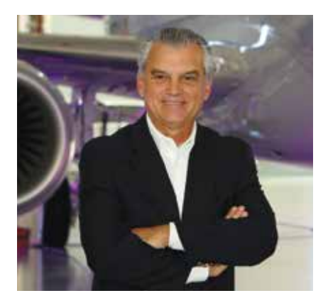
new technologies, new products and new business models which could generate opportunities for Embraer in the future." Embraer 's leadership roles in

"This is a unique opportunity to complement the air transport knowledge of a visionary and revolutionary ground transport company. We will be developing